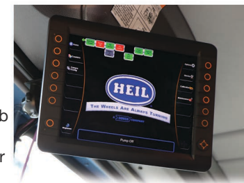
Shown with optional 12" Insight display