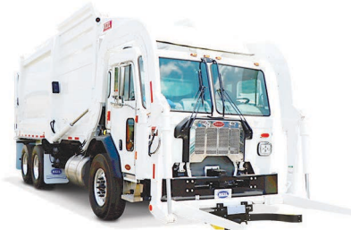
Available with Curotto commercial grabbers