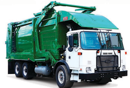
Available with Odyssey™ Hydraulic Controls