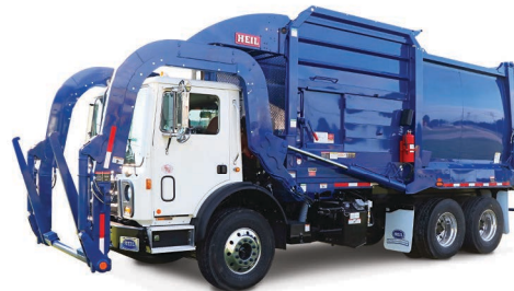
Available in 20 yard body configuration