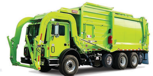
Available with 5-axle configuration