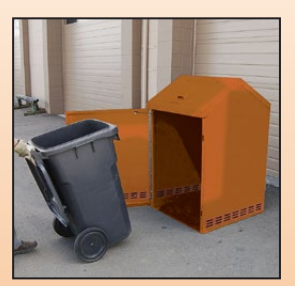
Houses 65 gallon poly cart.