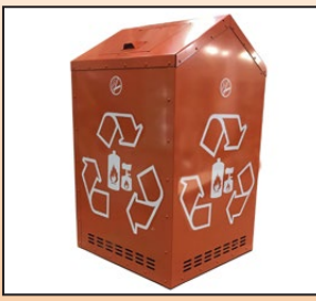
Custom decaling available.