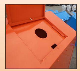
Restrictor plate under user door to control material collection.